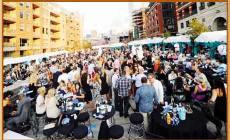
Guests enjoy the festivities at the Riverfront Park Fashion