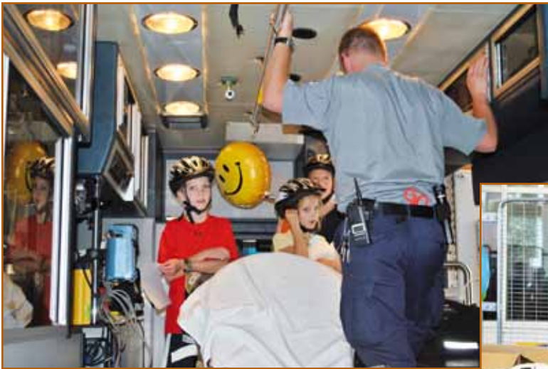
Kids learn and play during the celebration of the Child Life Zone

The Child Life Zone was donated to Denver Health by the Garth Brooks Teammates for Kids Foundation in partnership with the Troy Aikman Foundation. It is a 3,300 square-foot state-of-the-art therapeutic and educational sanctuary for pediatric patients and their families.