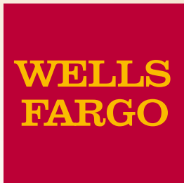
CORPORATION OF THE YEAR Wells Fargo